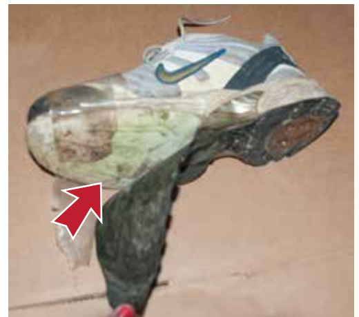
• Sole is falling off. Not in wearable condition.