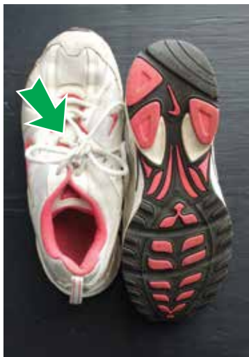
• Laces intact, lots of life left